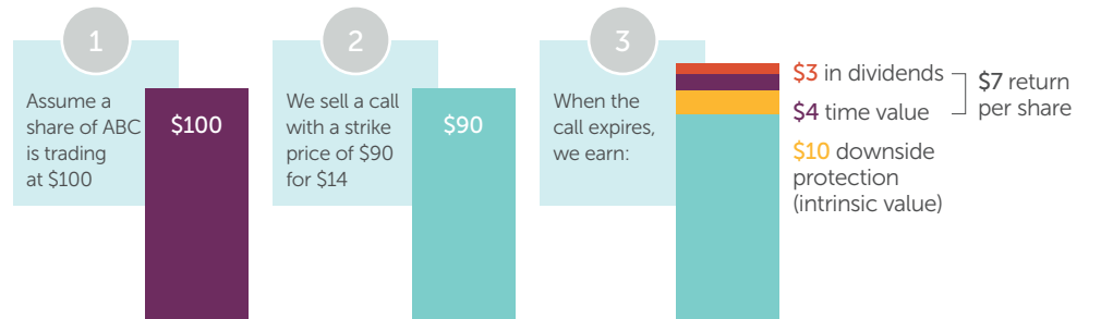
Exhibit 1: How the First Investors Premium Income Fund works

Duration of the call is one year and assumes the stock price is flat at call expiration. For illustrative purposes only. This data is not actual or based on any specific security. This is not a representation or guarantee that a security will achieve similar performance or pay dividends as to those shown.