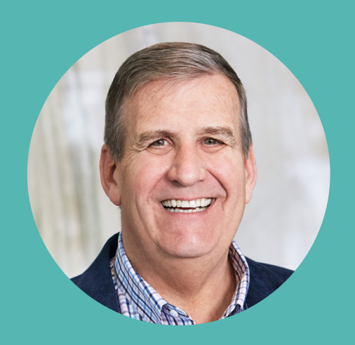
"By any measure, this past year has been busy and successful."

As I reflect on 2019, "successful" is the word that comes to mind.